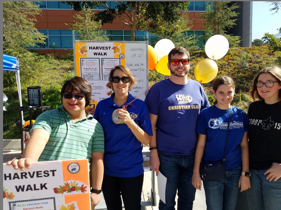
HARVEST WALK AROUND CAMPUS