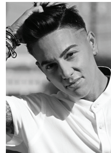
AD DIGGS VH1's Love & Hip-Hop: Hollywood personality and Creator of DiggTheKicks, a sneaker/clothing line