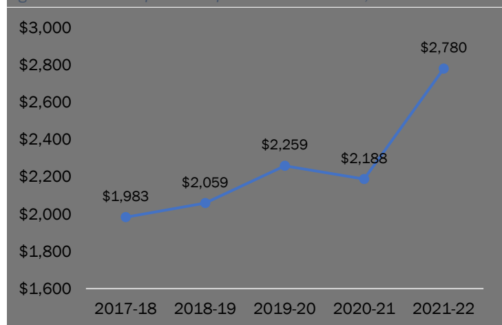
Figure 7. 2 LAHC Expenditure per Credit Enrollment, FY 17-18 to 21-22