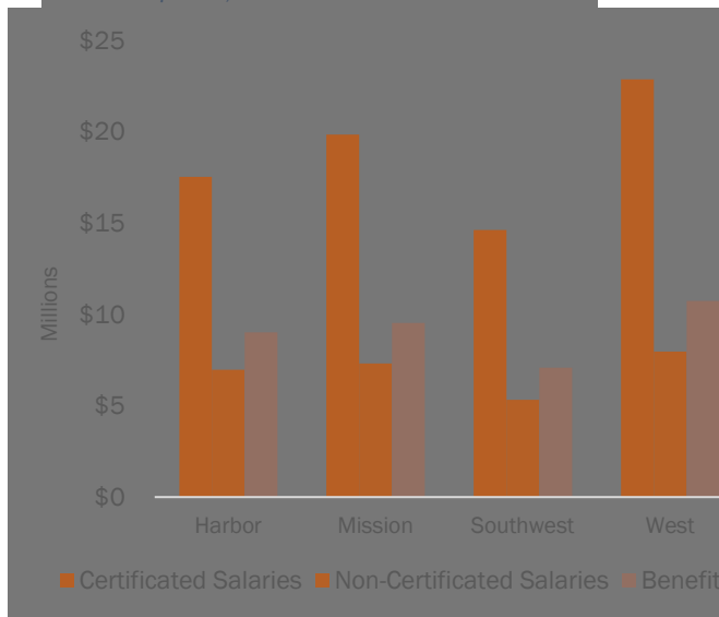
Figure 7. 6 Personnel Related Expenditures by Small Campuses, FY 2021-22