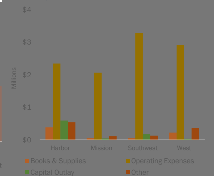
Figure 7. 7 Non-Personnel Related Expenditures by Small Campuses, FY 2021-22