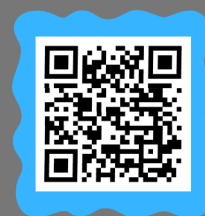
GUIDE TO LEWERMARK