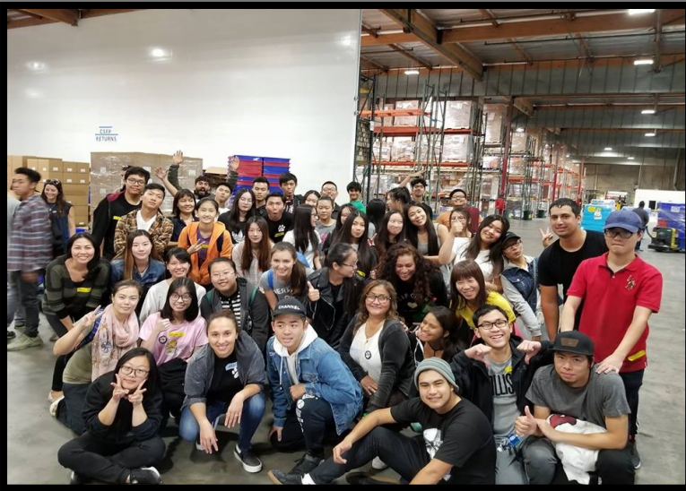
The ESL Club at the Los Angeles Food Bank

The ESL Club is one of the most active clubs on campus. Students make new friends and practice their English skills while engaging in fun activities. One activity that the club participated in this fall was to volunteer at the Los Angeles Food Bank to help their community. Students were excited to speak and work with native speakers of English there. In addition to volunteering, the Club hosted its first Halloween party. Students enjoyed dressing up in their costumes, and they danced with their family, friends, and professors. Club members feel more connected with the campus and their professors after participating in the club. ESL Credit and Noncredit students are welcomed to join.