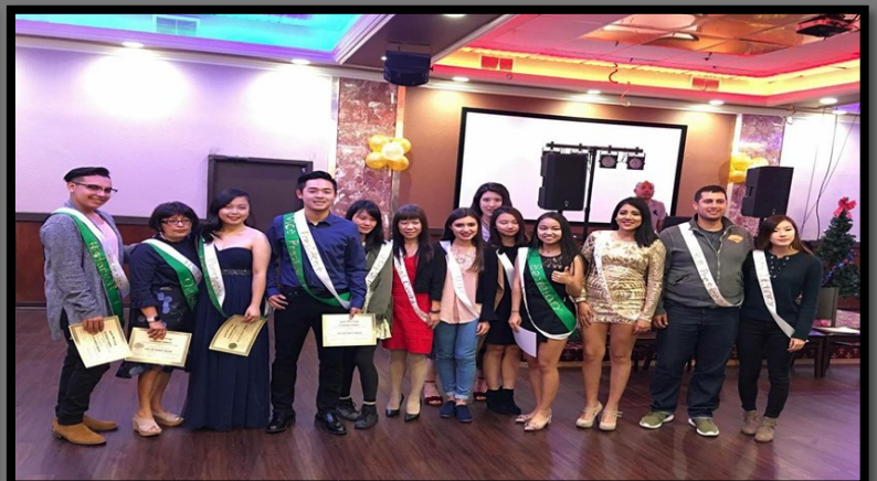
Spring 2018 Board Members at the fall banquet

Please join the ESL Club in Spring 2018.