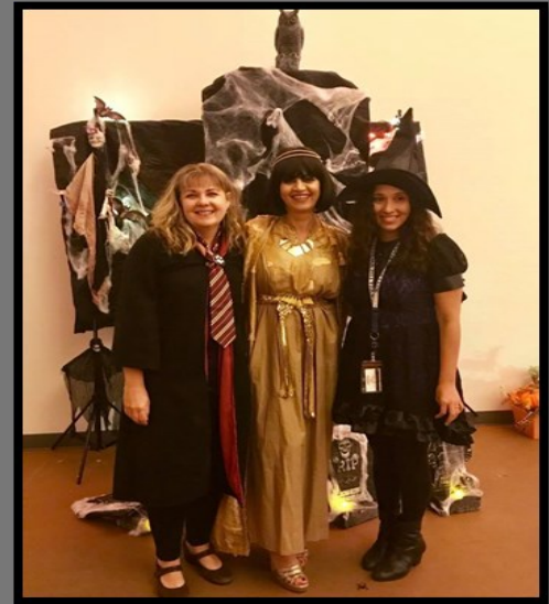
The ESL Club Advisors at the Halloween party.