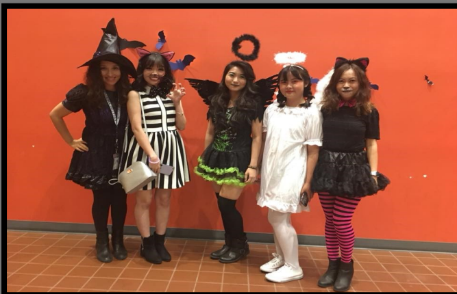
Club members and their advisor at the Halloween party